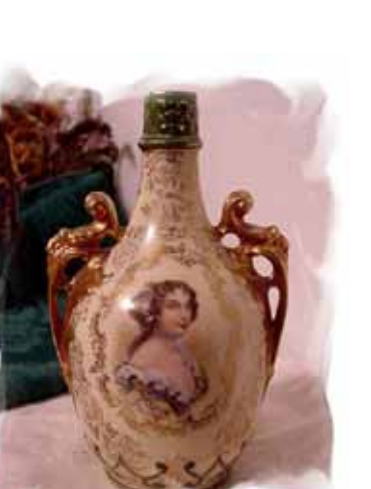
7" Royal Saxe Portrait Vase $43.01