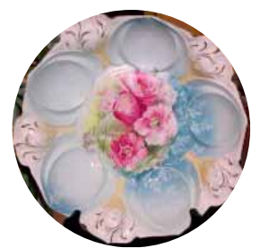
11" Bowl & 2 matching Plates - $82.51