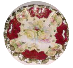
11" 2-Hnd Cake Plate $128.50