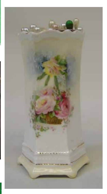
Floral Hatpin Holder - $81