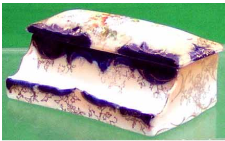
Match Holder with Strike - $125