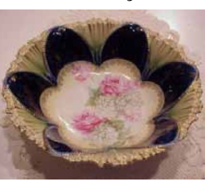
10¾" Colbalt Floral Bowl - $299.99