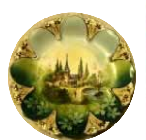
81/2" Castle Plate $165