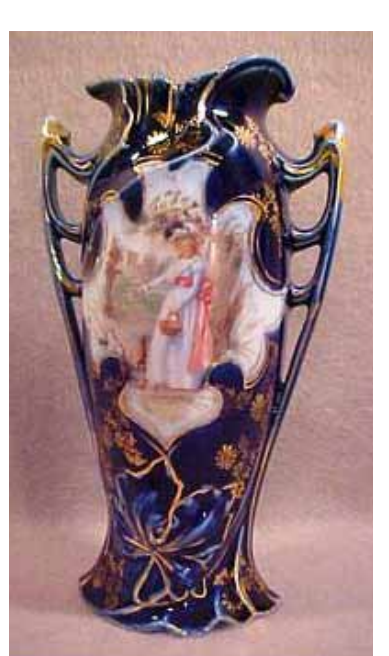
71/2" Colbalt Vase Lady with Chickens - $787.77