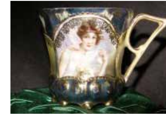
Fall Season Demitasse Cup with Tiffany - $316