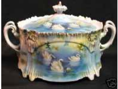
Swan Icicle Cracker Jar- $787.77